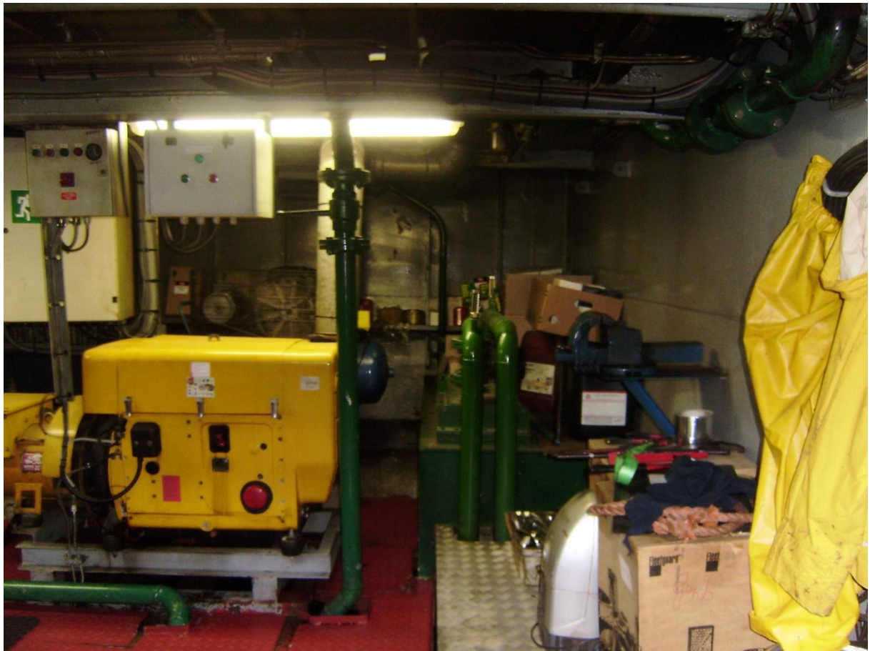
Generator aft ship